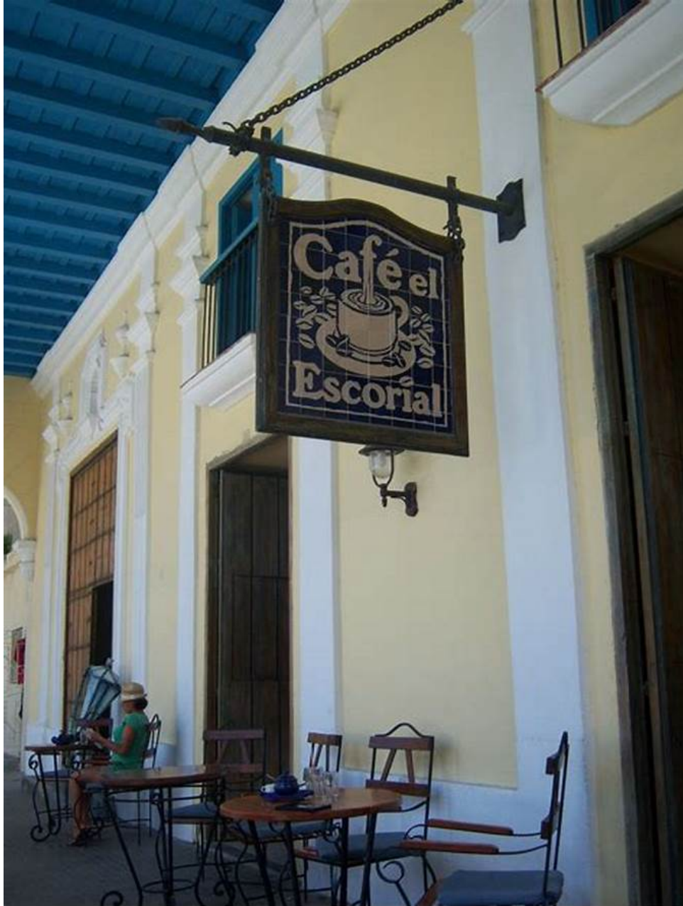
Heladería Coppelía: The iconic ice cream parlor of Havana, famous for its long lines and delectable flavors.