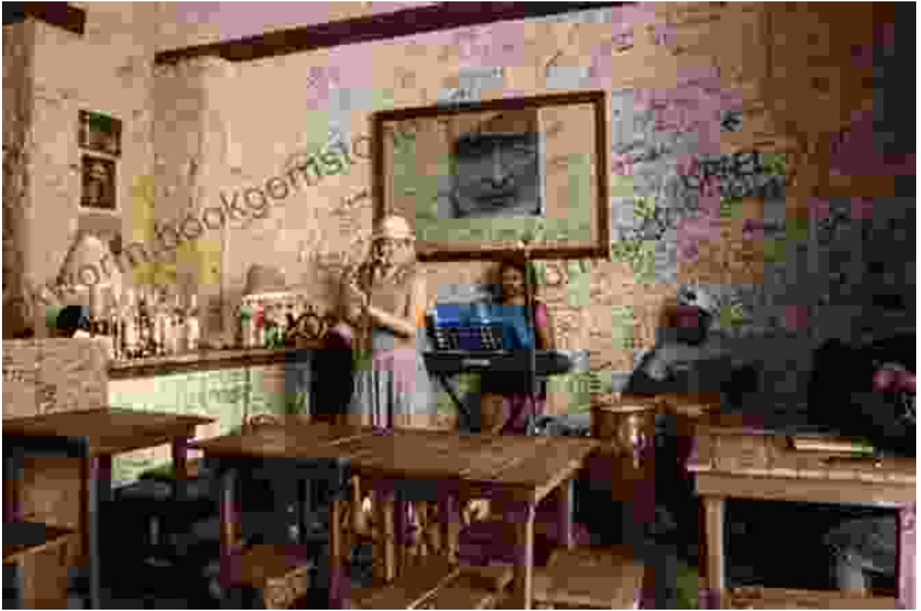
Bars and Cafés