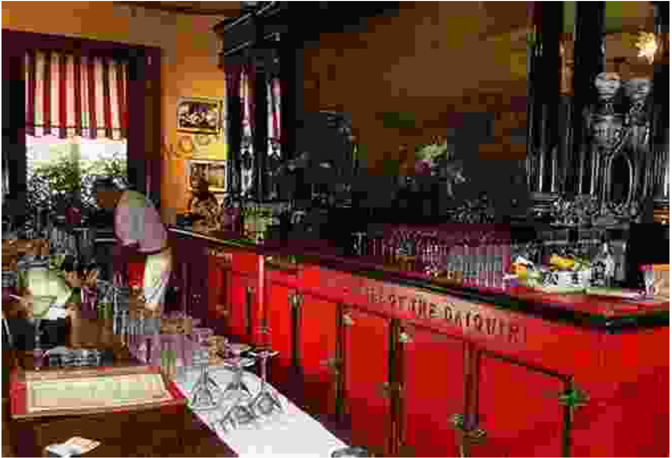
San Cristóbal Paladar: An award-winning restaurant serving traditional Cuban dishes with a modern twist.