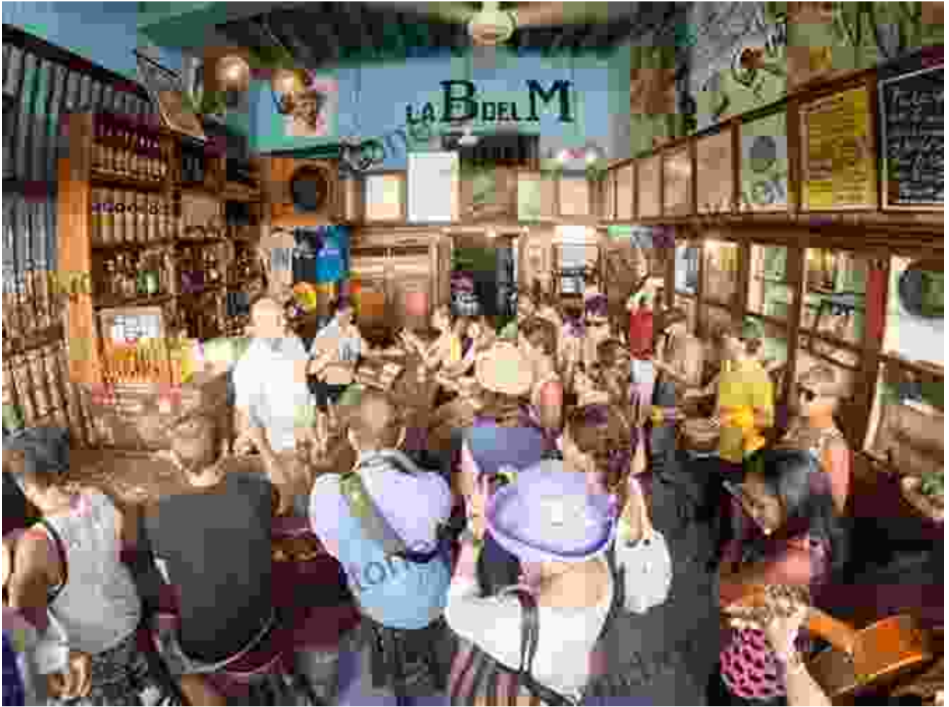
El Floridita: Hemingway's favorite haunt, famous for its daiquiris and seafood platters.