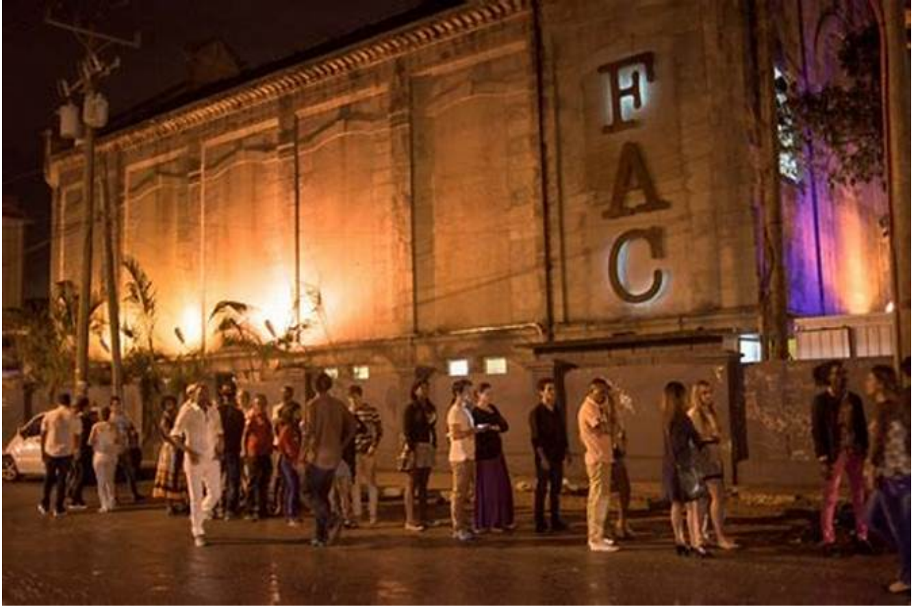
Café El Escorial: A charming café with a vintage atmosphere and delicious coffee.