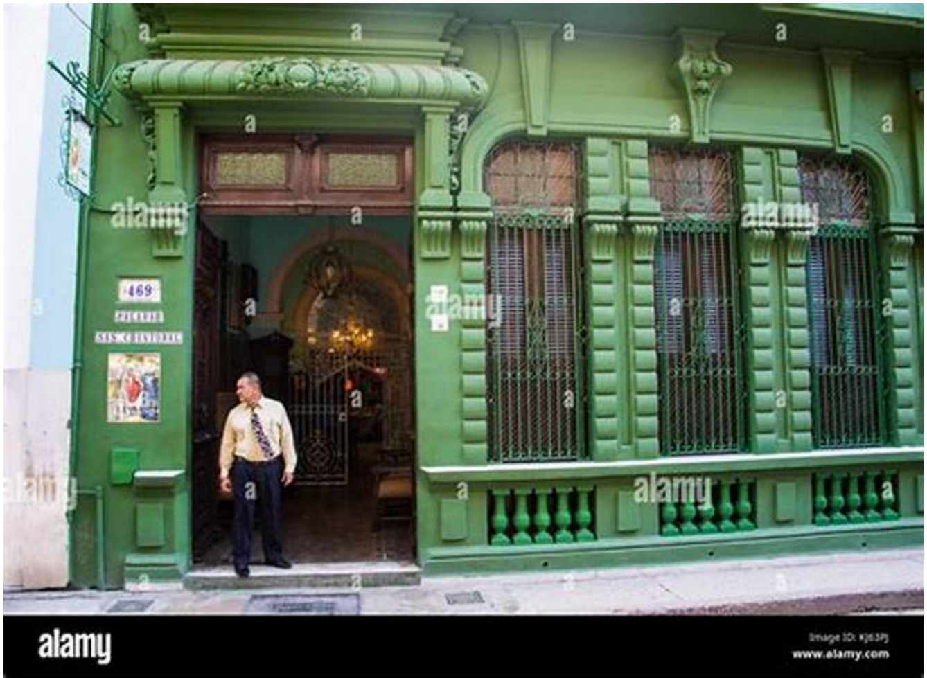
El Cocinero: A cozy restaurant renowned for its slow-roasted pork and traditional Cuban stews.