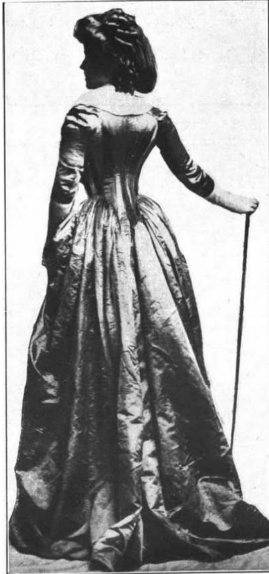
TAILLE TRÈS AJUSTÉE SUR UNE TOURNURE, MANCHES EN AMADIS. D'après une robe datant de 1787 appartenant à la Société de l'Histoire du Costume.