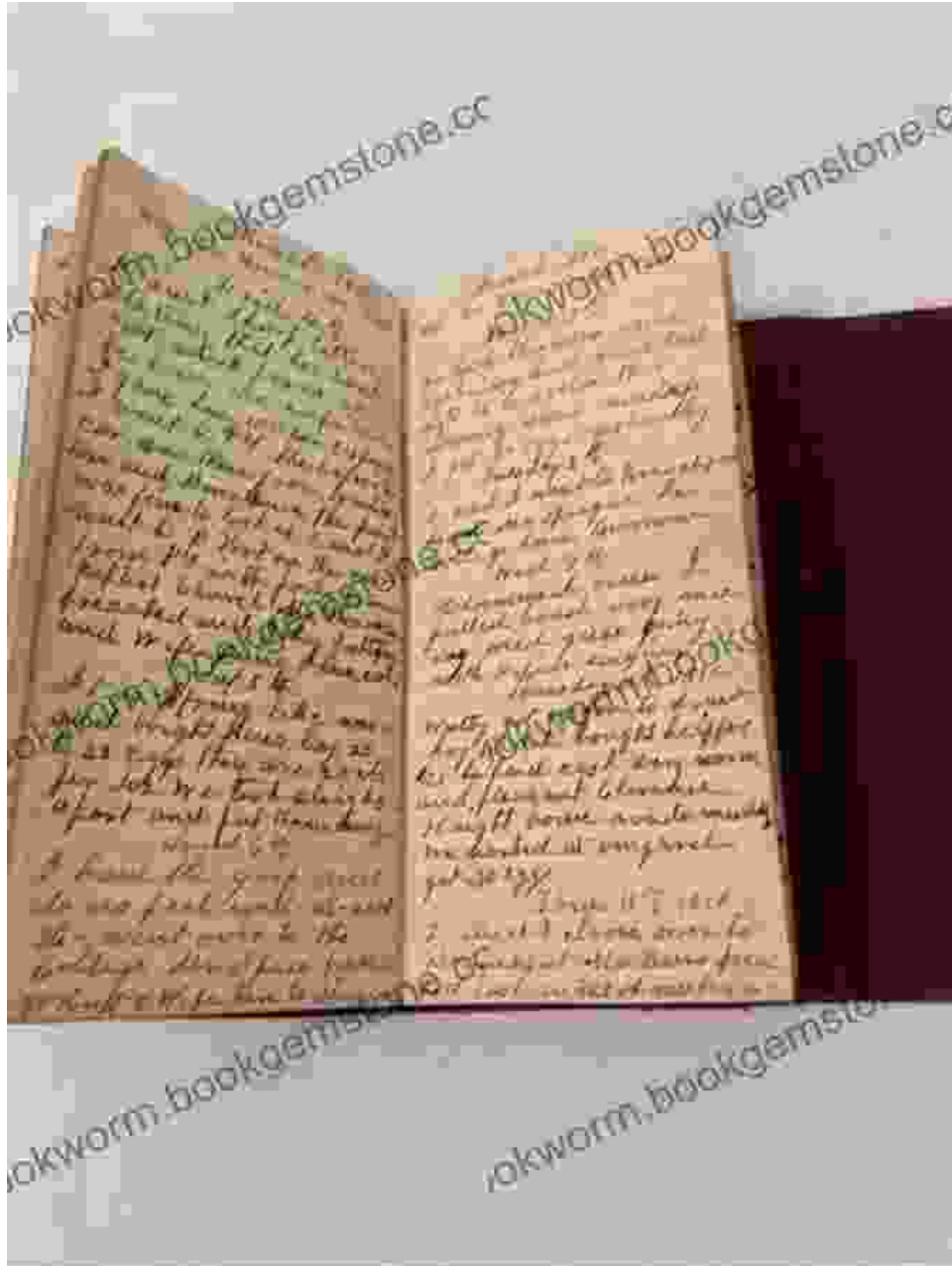
The Diary, an intimate whisper from the past, unveils the secrets of the Historical Center.

experiences of those who called the Center home. Through its pages, we witness firsthand the joys, sorrows, and challenges that shaped their daily existence.