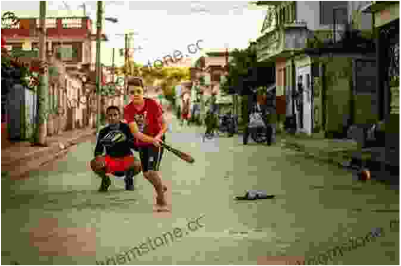
Impromptu street games are a common sight in Cuba, reflecting the widespread passion for baseball.