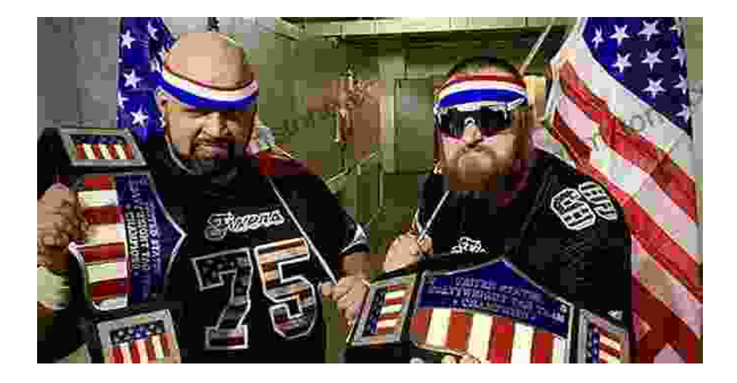
The Dogs of War with the NWA United States Tag Team Championship