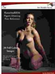
Figure drawing is a challenging but rewarding art form. It requires a strong understanding of human anatomy and the ability to capture the subtle nuances of the human form. One of the best ways to improve your figure drawing skills is to use pose reference art models.