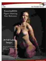
Figure drawing pose reference art models are a valuable tool for any artist who wants to improve their skills. By using these models, you can learn about the human body in a more realistic way, create more accurate drawings, and capture the energy and movement of the human body. So if you are interested in improving your figure drawing skills, I encourage you to start using pose reference art models today.